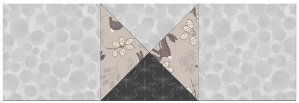
Figure 1: Pieced square in the centre

Sew the pieced squares and fabric squares in rows, as shown in the Table Runner diagram