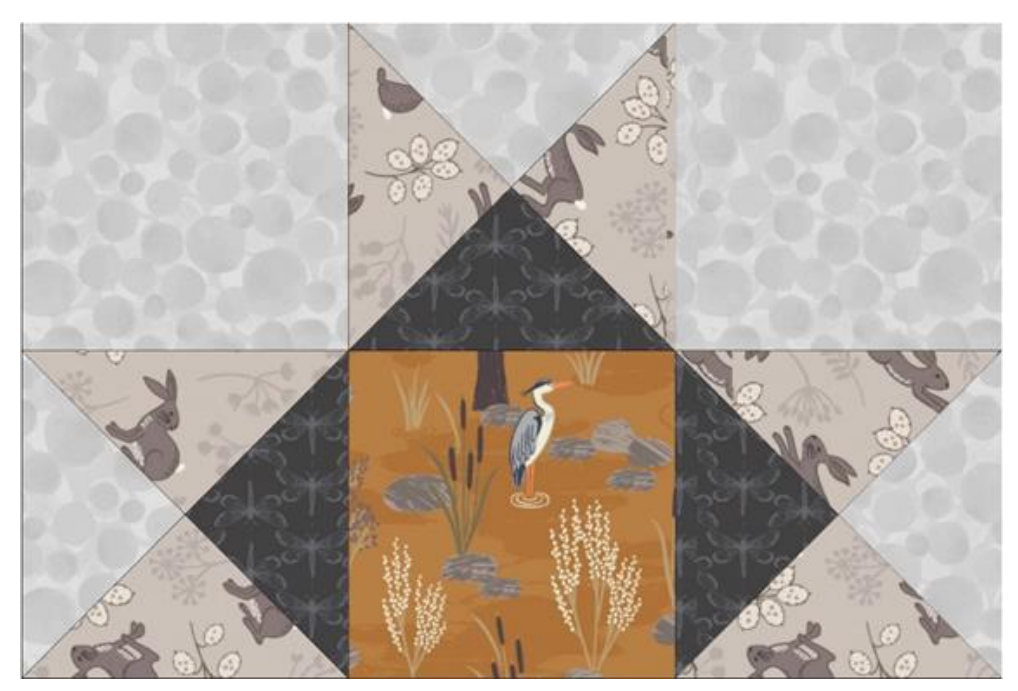
Figure 2: Pieced squares either side