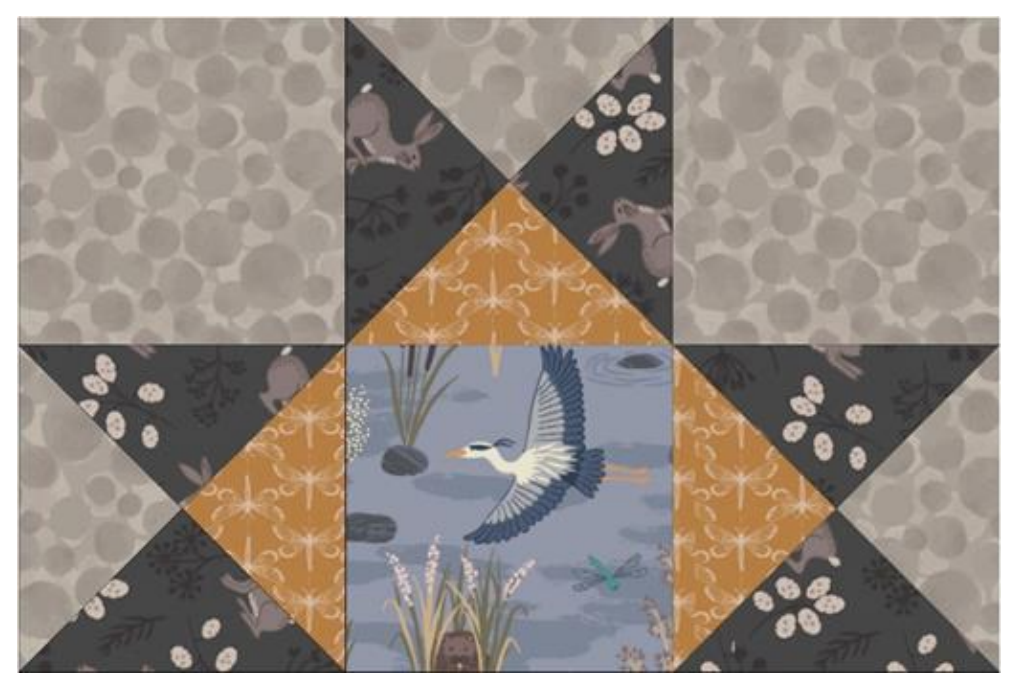
Figure 2: Pieced squares either side