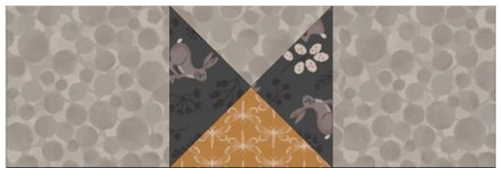
Figure 1: Pieced square in the centre

Sew the pieced squares and fabric squares in rows, as shown in the Table Runner diagram